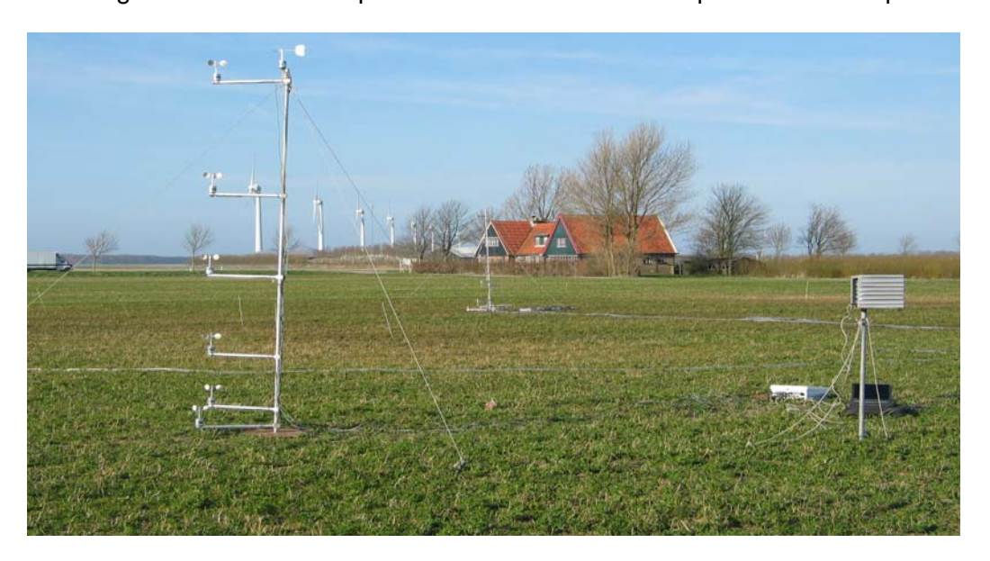
Figure 2. Meteorological mast holding cup anemometers to measure wind speed at five heights. In the background the centrally located mast holding the ammonia traps

The meteorological mast has to be placed close to the manured plot and in the open field.