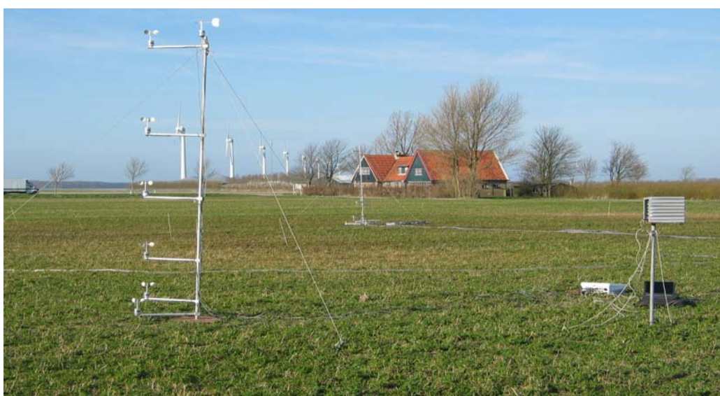
Figure 2. Meteorological mast holding cup anemometers to measure wind speed at five heights. In the background the centrally located mast holding the ammonia traps

The meteorological mast has to be placed close to the manured plot and in the open field.